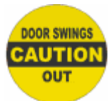
(Same both sides)