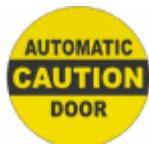
(Same both sides)