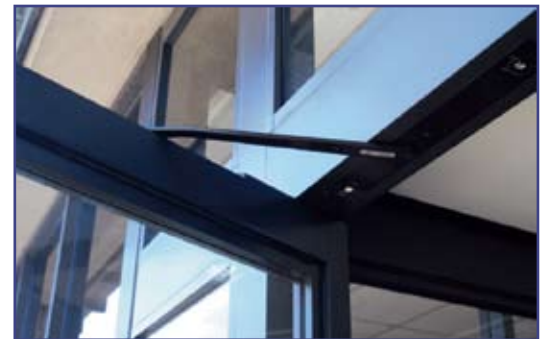
LCN Door Closer